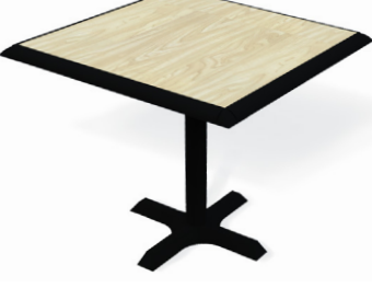
Square 24", 30", 36", 42", 48", 54", 60"