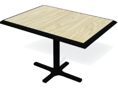
Rectangle W: 24-48", L: 30-72"