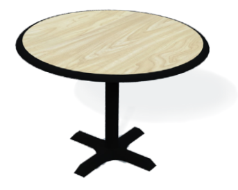
Round 24", 30", 36", 42", 48" 54", 60"