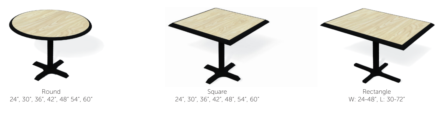
TABLE OPTIONS 45# particle board core, 1.25" overall thickness, Carb I and II compliant